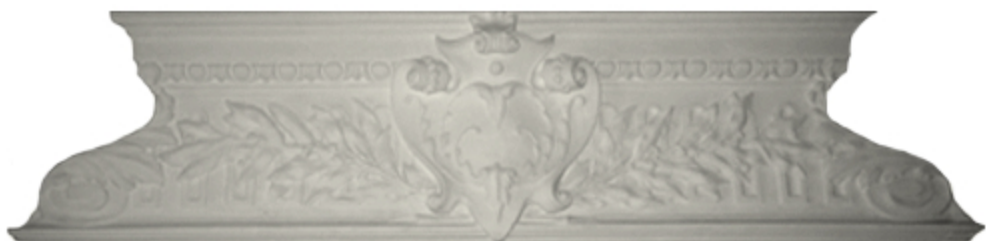
5308 148*37,5 cm