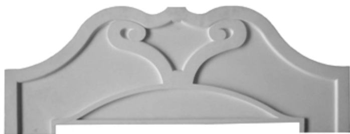
5307 132,5*45 cm