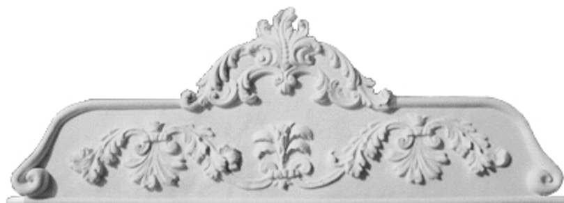
5077 112*40,5 cm